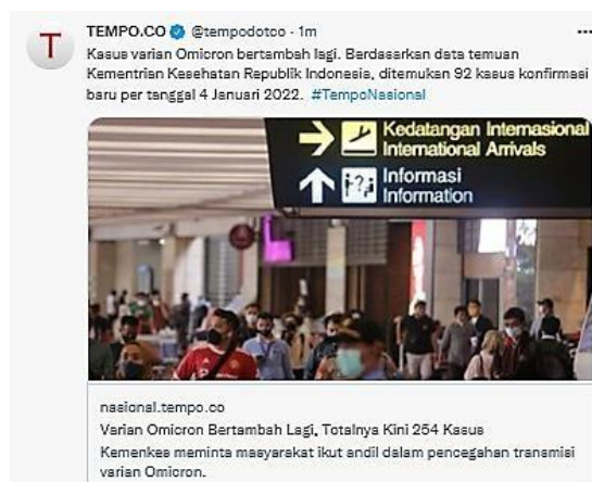
Figure 3. Official account's posts