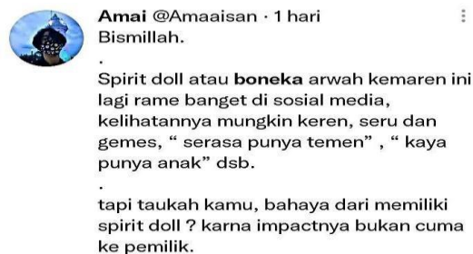
Figure 7. General public account posts