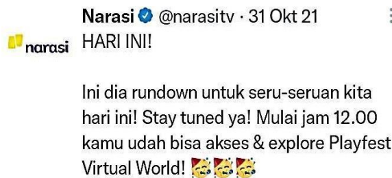
Figure 4. Public figure's account posts

From Figures 1, 2, and 3 What we take from the Twitter accounts of Kompas TV, TvOnenews, and Tempo.Co, we can see that the three Twitter accounts show the use of a variety of formal languages. This is because the account owner spreads news related to the discussion of real news, for example in figure 3 "The cases of the Omicron variant are increasing again. Based on data from the Ministry of Health of the Republic of Indonesia, there were 92 new confirmed cases as of January 4, 2022," and the news is serious.