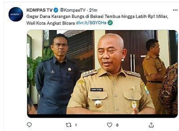
Figure 1. Official account's posts

Words This slang on social media Twitter is often used in tweets made by someone.