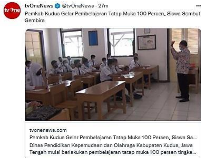
Figure 2. Official account's posts