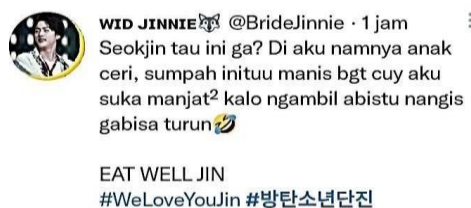
Figure 8. General public account posts

From 6, 7, and 9 we take From the accounts of the general public, we can see that the three Twitter accounts show the use of a variety of informal languages. This can be seen from the use of the words “rame banget”, “seras”, “gemes”, “temen”, “cuma”, “cuy”, “abistu”, “nangis”, “manjat2”, “tau”, “cuy”, “inituu”, “name”, “taking”, and “kalo” which denote informal words. Because by using informal language, they can express opinions in a relax situations and not too serious situation.